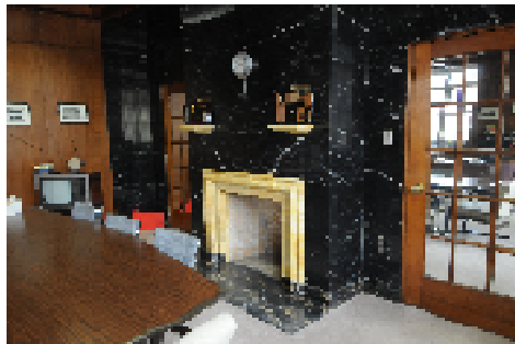
Unique Original Art Deco Character