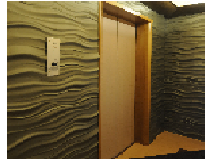
Interesting Details Throughout