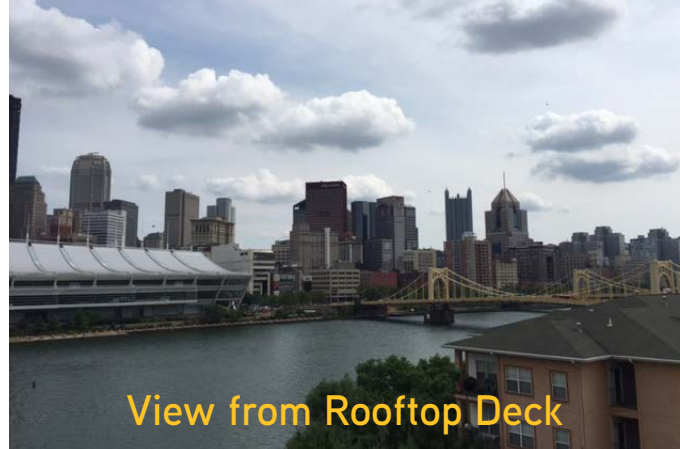
View from Rooftop Deck